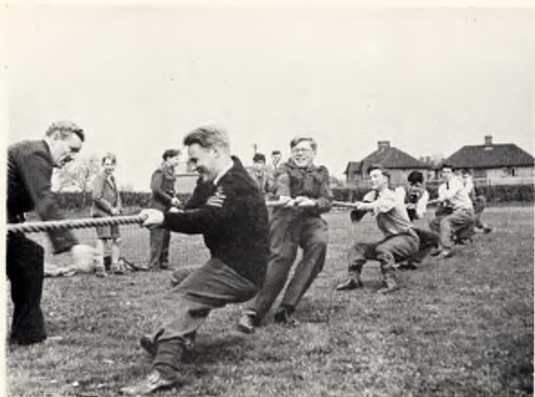
TUG-OF-WAR : THE GALLANT LOSERS