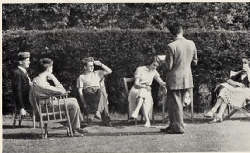
A STUDY GROUP IN ACTION