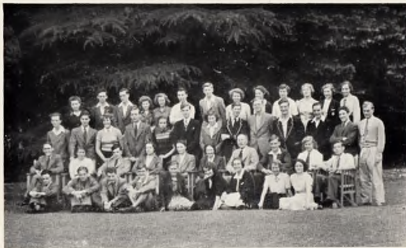
SHORTENILLS, JULY, 1951